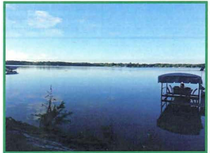
Oconomowoc Lake at Dusk

If you would like to learn more, please contact Tom Steinbach at 262-569-2192 or tsteinbach@oconomowoc-wi.gov