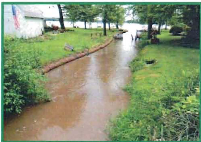
Siltation after heavy rains in Mason Creek flowing into North Lake